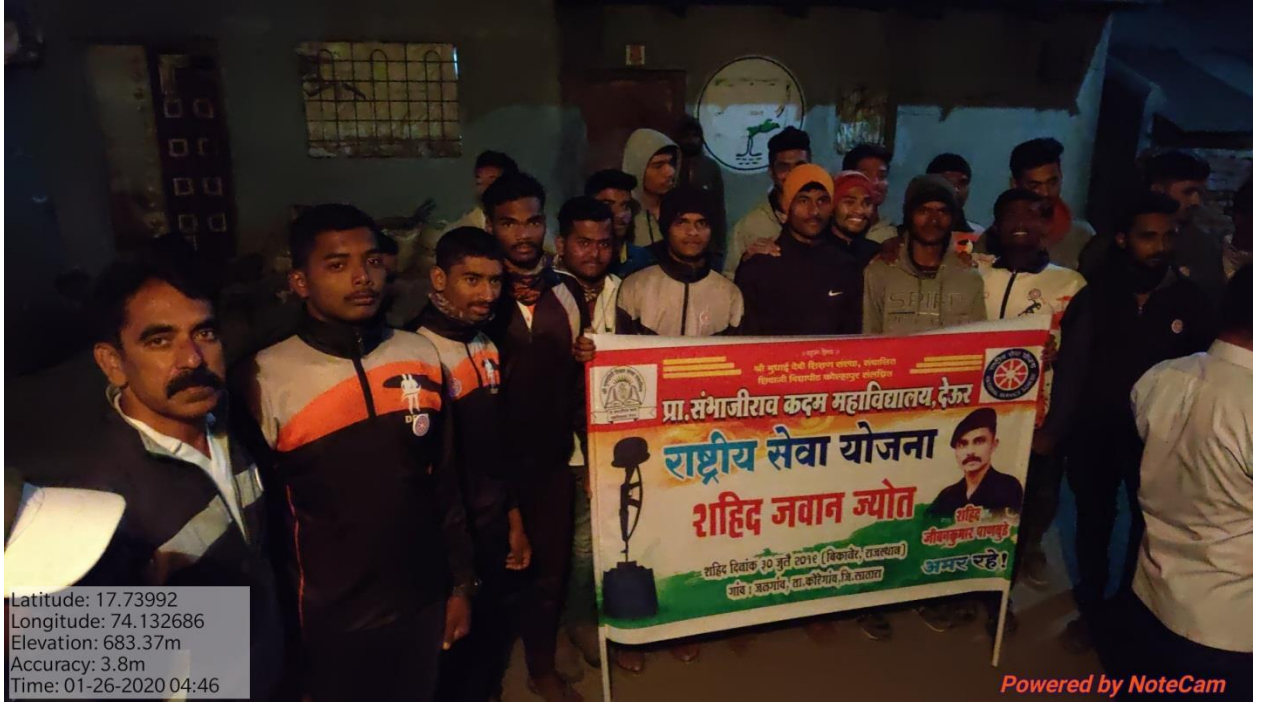
शहीद जवान ज्योत आणताना महाविध्यालायाचे स्वयंसेवक