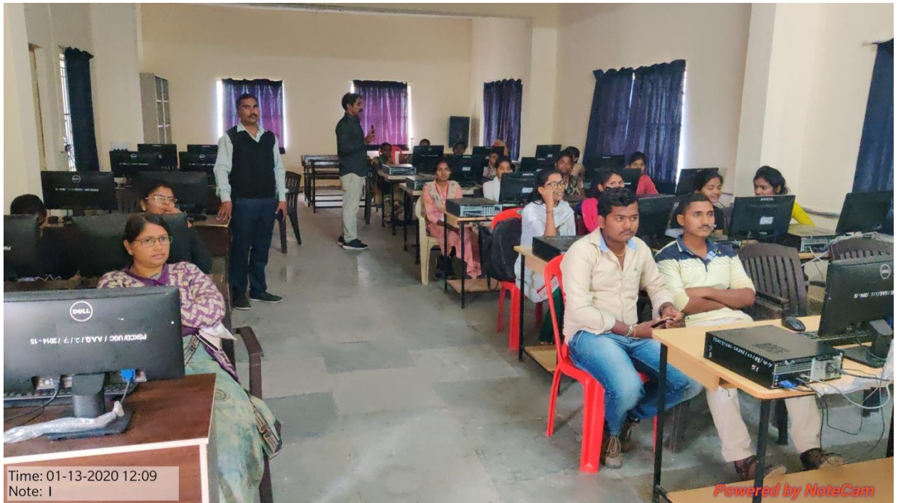
HIV Awareness Programme inviting Stakeholders (Deur Village People)