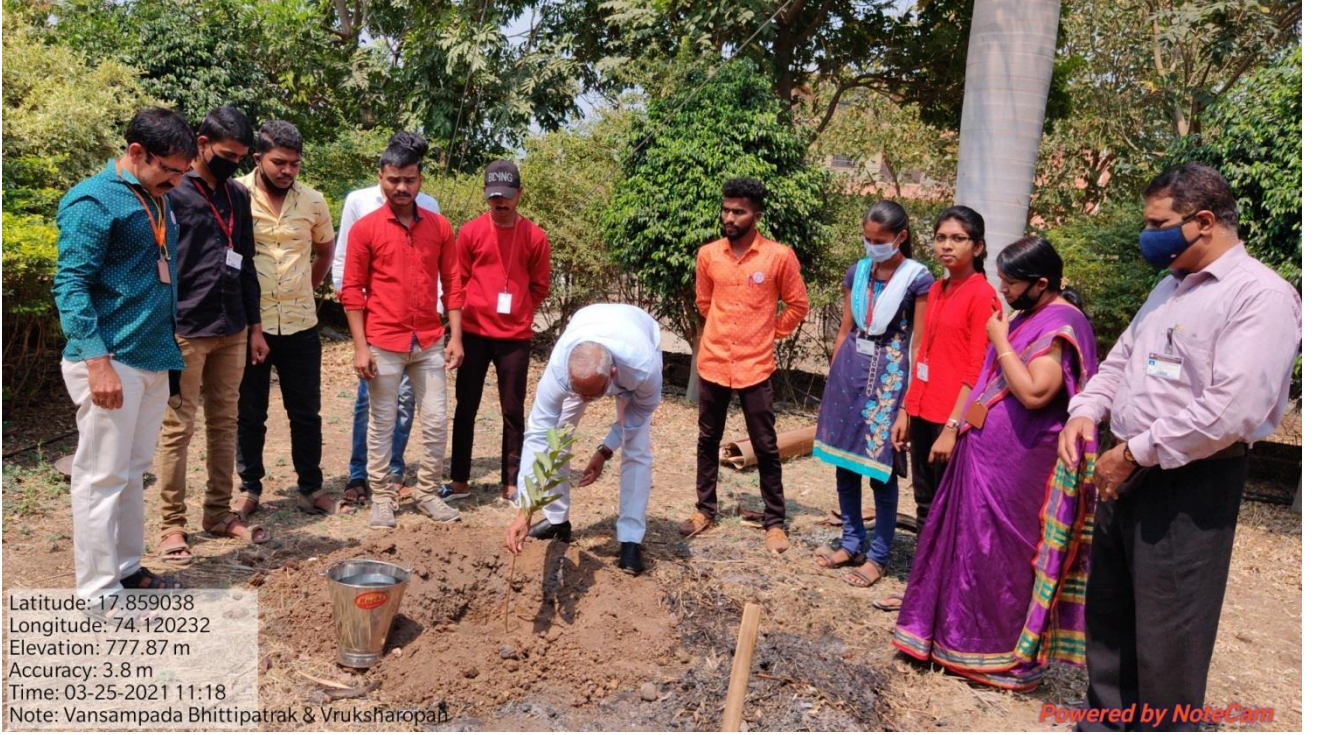
यंग इन्स्पिरेटीव नेटवर्क सातारा यांनी दिलेली वृक्षांचे रोपण करताना मा.प्राचार्य