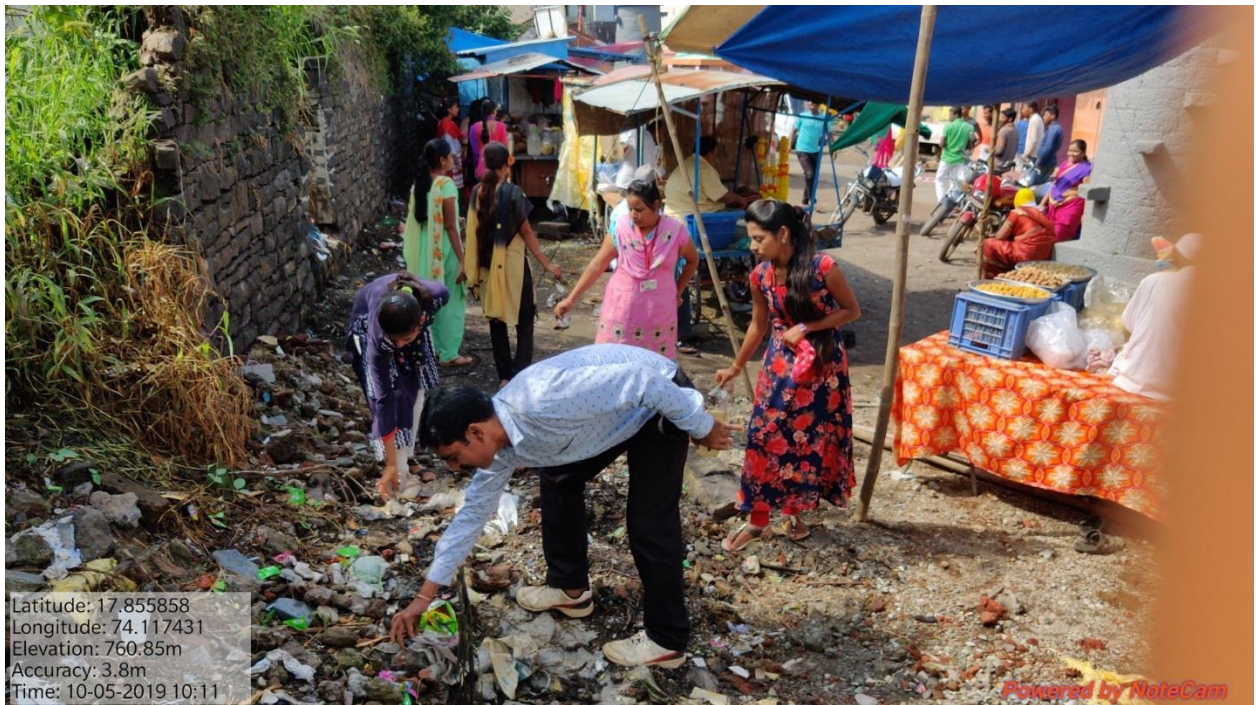
05.10.2019 Swachh Bharat Abhiyan: Plastic Free Movement at Deur