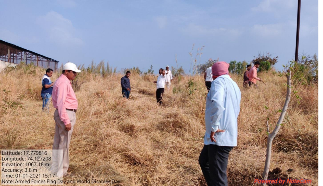
कल्याणगड येथे श्रमदान करताना महाविद्यालयाचा स्टाफ व विद्यार्थी