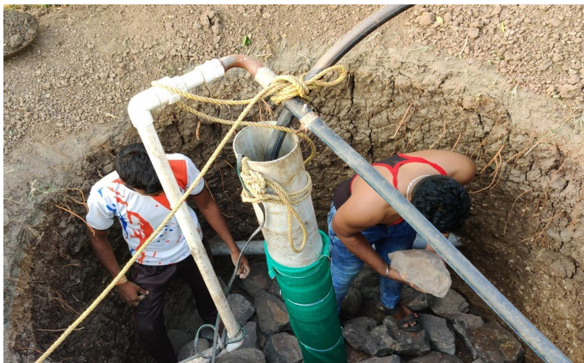
Roof Water Harvesting and Borewell Recharge at Dahigaon Village