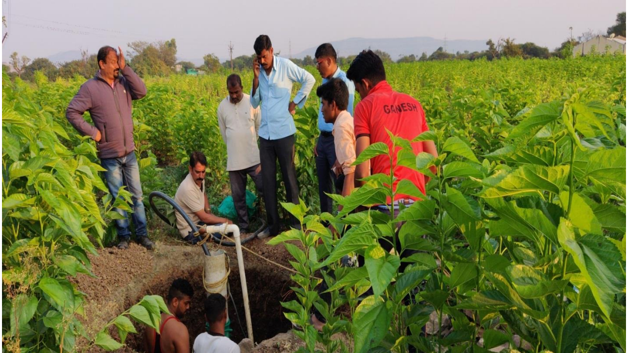
Roof Water Harvesting and Borewell Recharge at Dahigaon Village