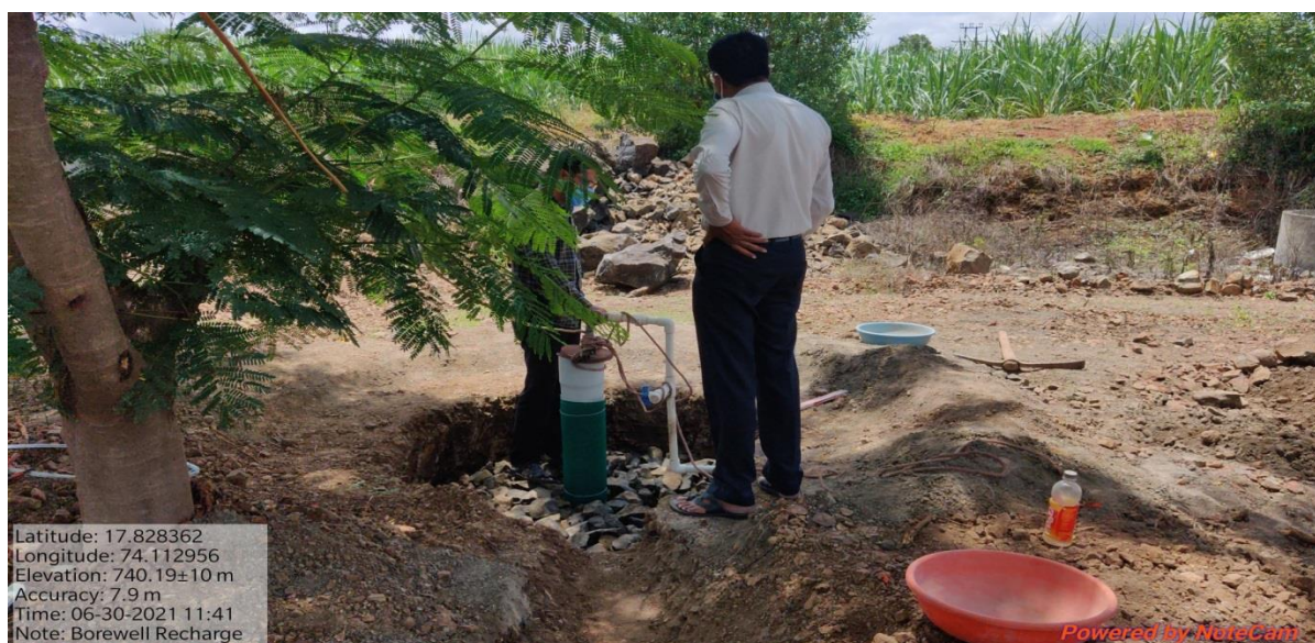
Photo of Roof Water Harvesting and Borewell Recharge at Palashi Project in 2021