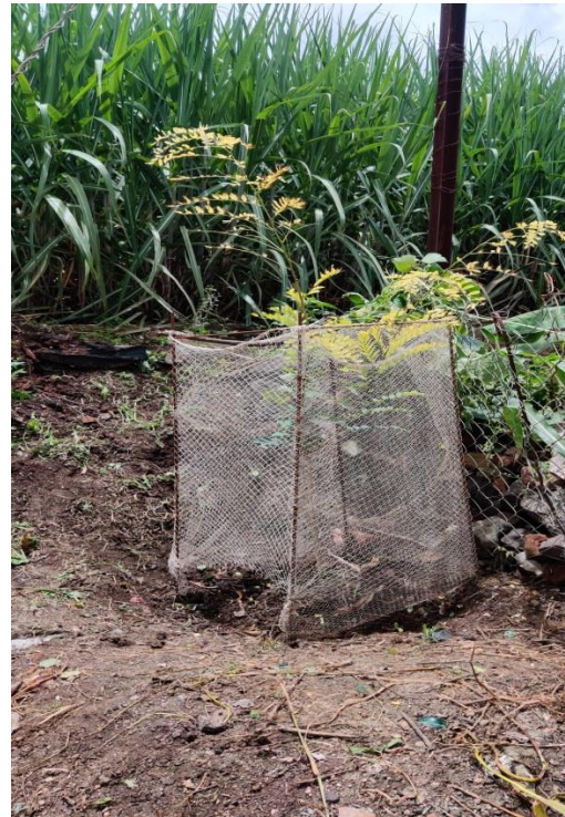
संवर्धनानंतर (After conservation)