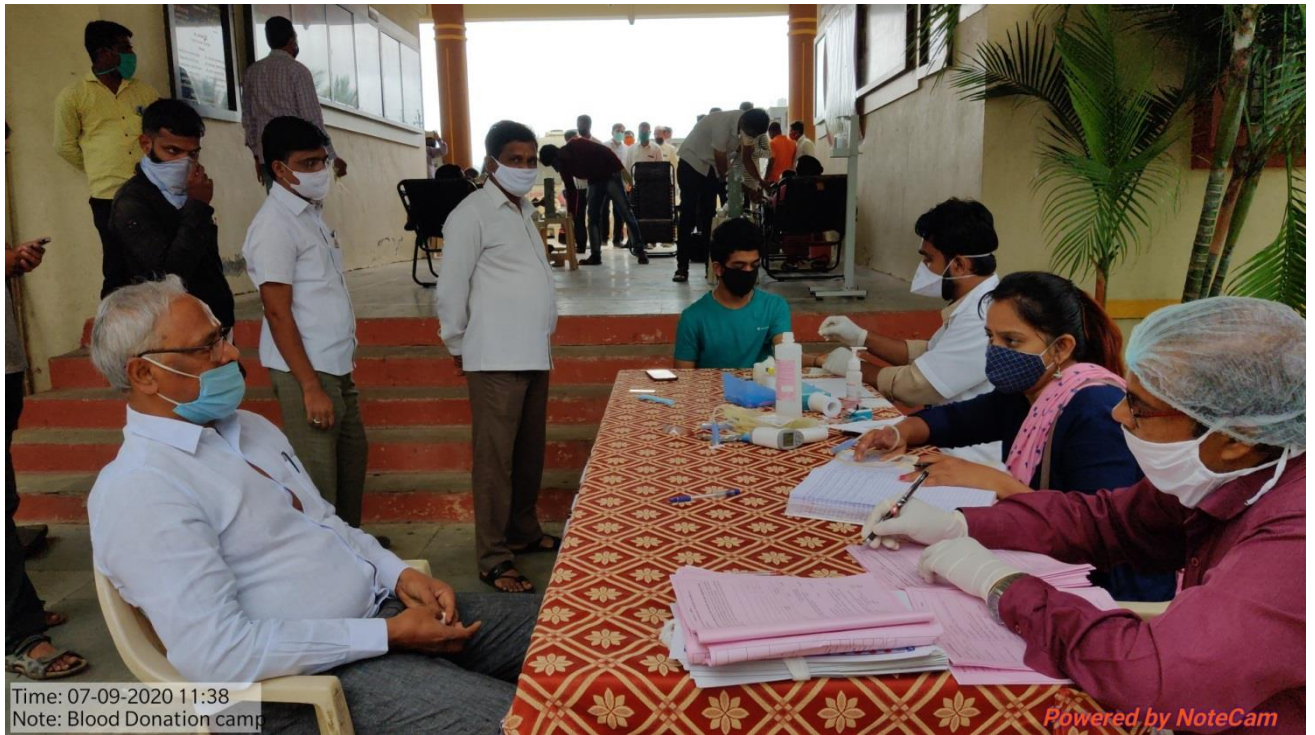
Organized a Blood Donation Camp under Corona-Pandemic Situation for Village, Deur09.07.2020