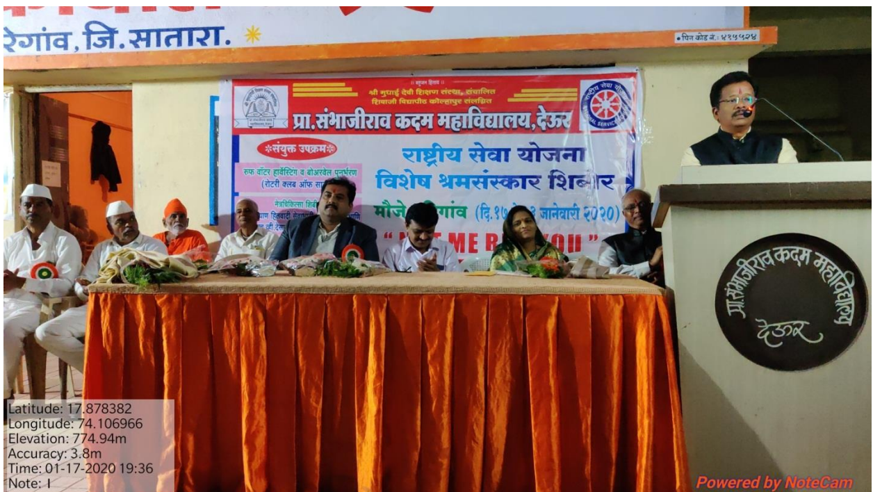
A Collaborative Programme with Rotary Club and NSS: The Social Movement of Youth (an MOU Activity)