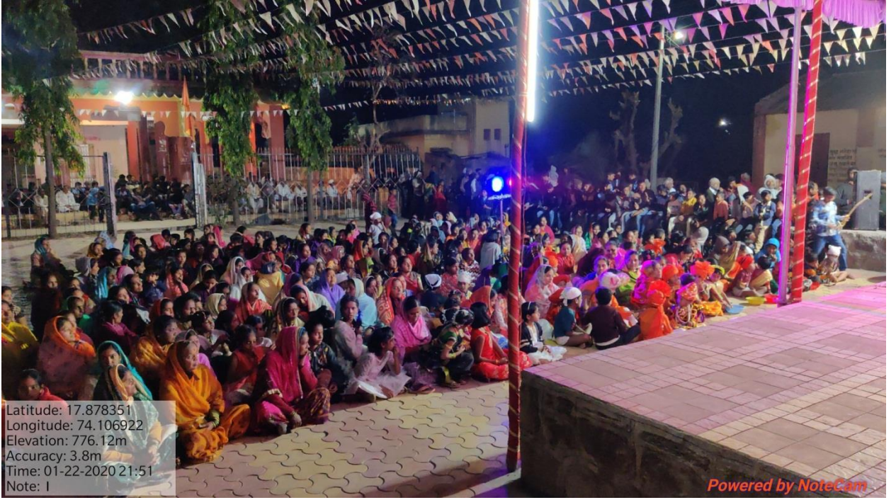
दि.२२.०१.२०२० रोजी सांस्कृतिक कार्यक्रम सादर करताना जि. प. शाळा व अंगणवाडी, दहिगाव विद्यार्थी उपस्थित ग्रामस्त व शिबिरार्थी