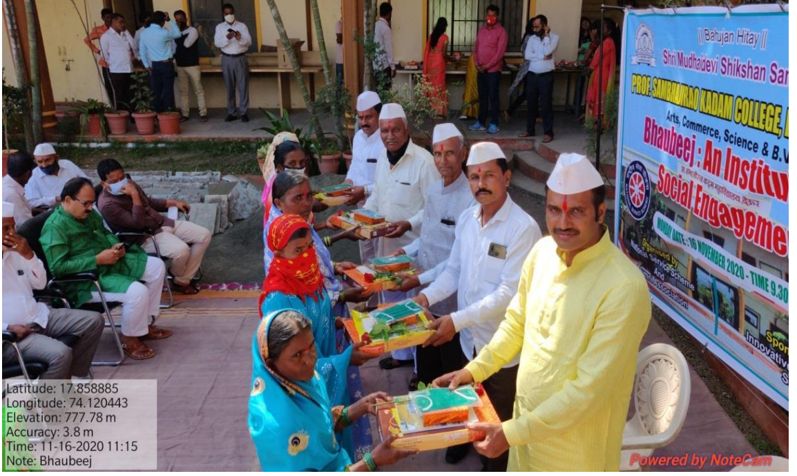
भाऊबीज कार्यक्रमप्रसंगी पंचक्रोशीतील सरपंचाचे औक्षण करताना भगिनी