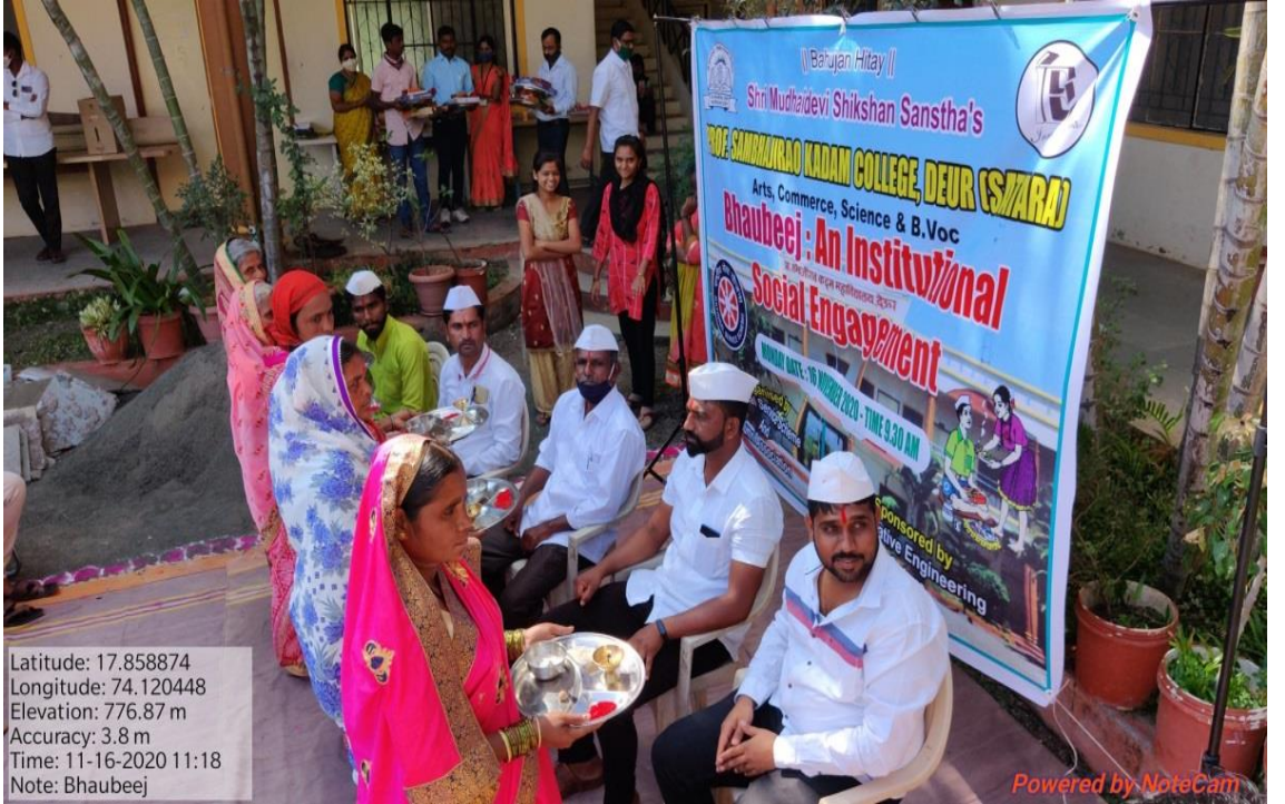
भाऊबीज कार्यक्रमप्रसंगी माजी विद्यार्थी व ग्रामस्थांचे औक्षण करताना भगिनी