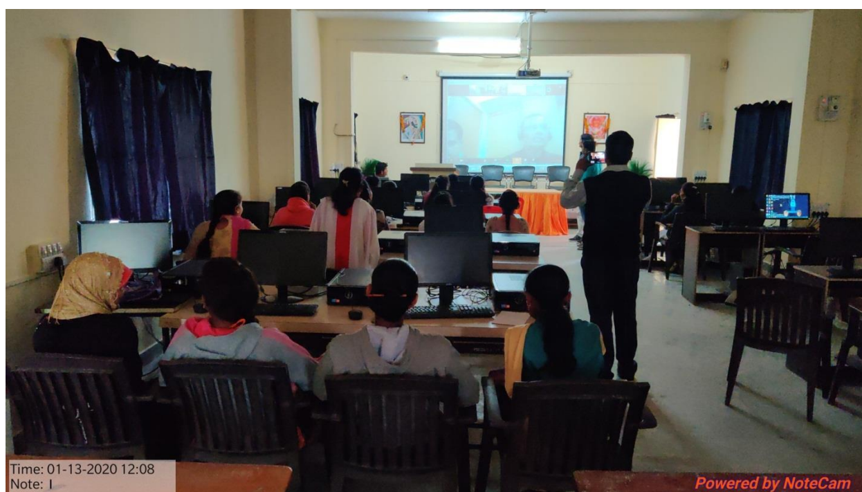
HIV Awareness Programme inviting Stakeholders (Deur Village People)