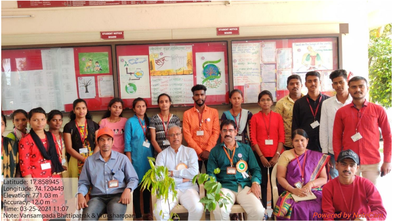
वनसंपदा भित्तीपत्रक संपादक मंडळ समवेत मा .प्राचार्य व स्टाफ व विद्यार्थी