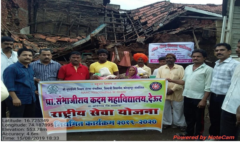
Helping the Flood Affected People in Kolhapur District (Village Prayag-Chikhali)