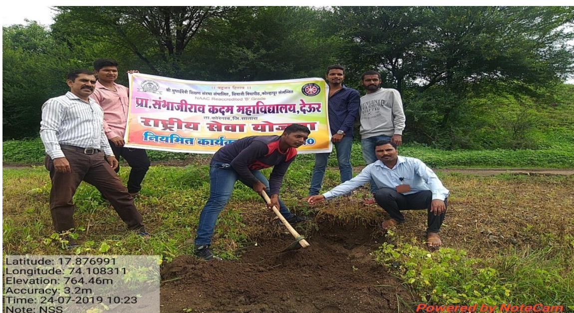
Observed a Tree Plantation Drive at Deur and Dahigaon Villages