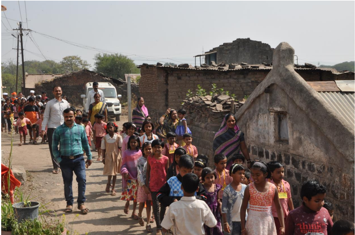
17.01.2020 Organized a Rally on National Integrity & Awareness in Dahigaon Village