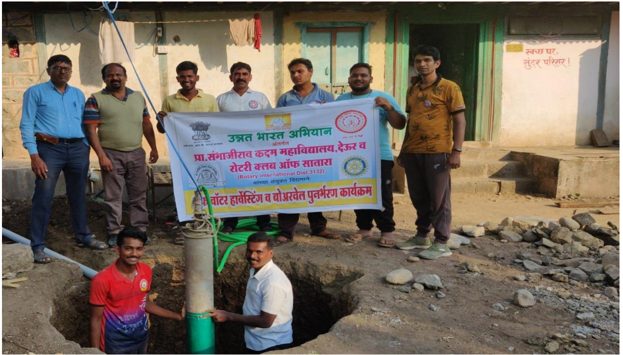
Roof Water Harvesting and Borewell Recharge at Dahigaon Village