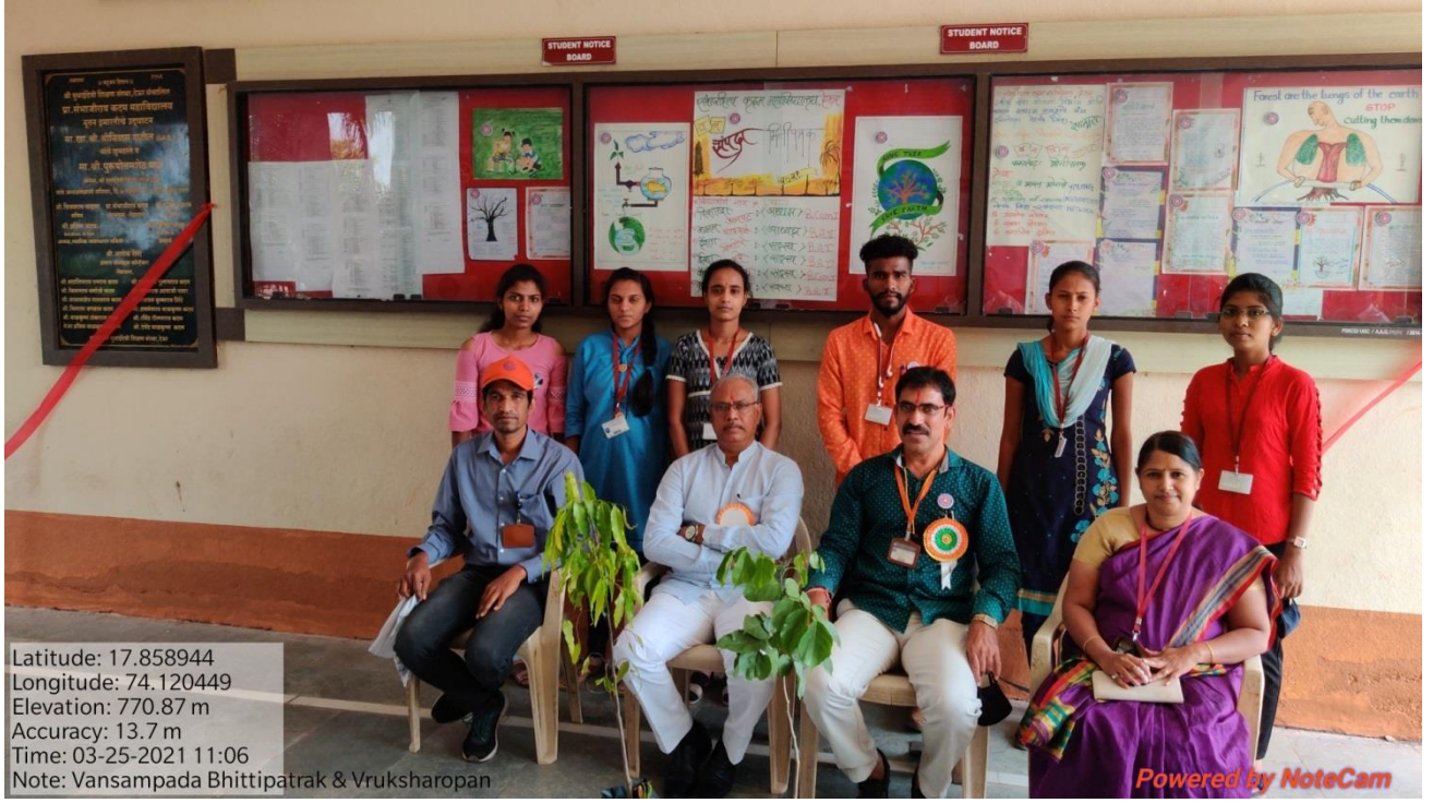
वनसंपदा भित्तीपत्रक संपादक मंडळ समवेत मा .प्राचार्य व स्टाफ