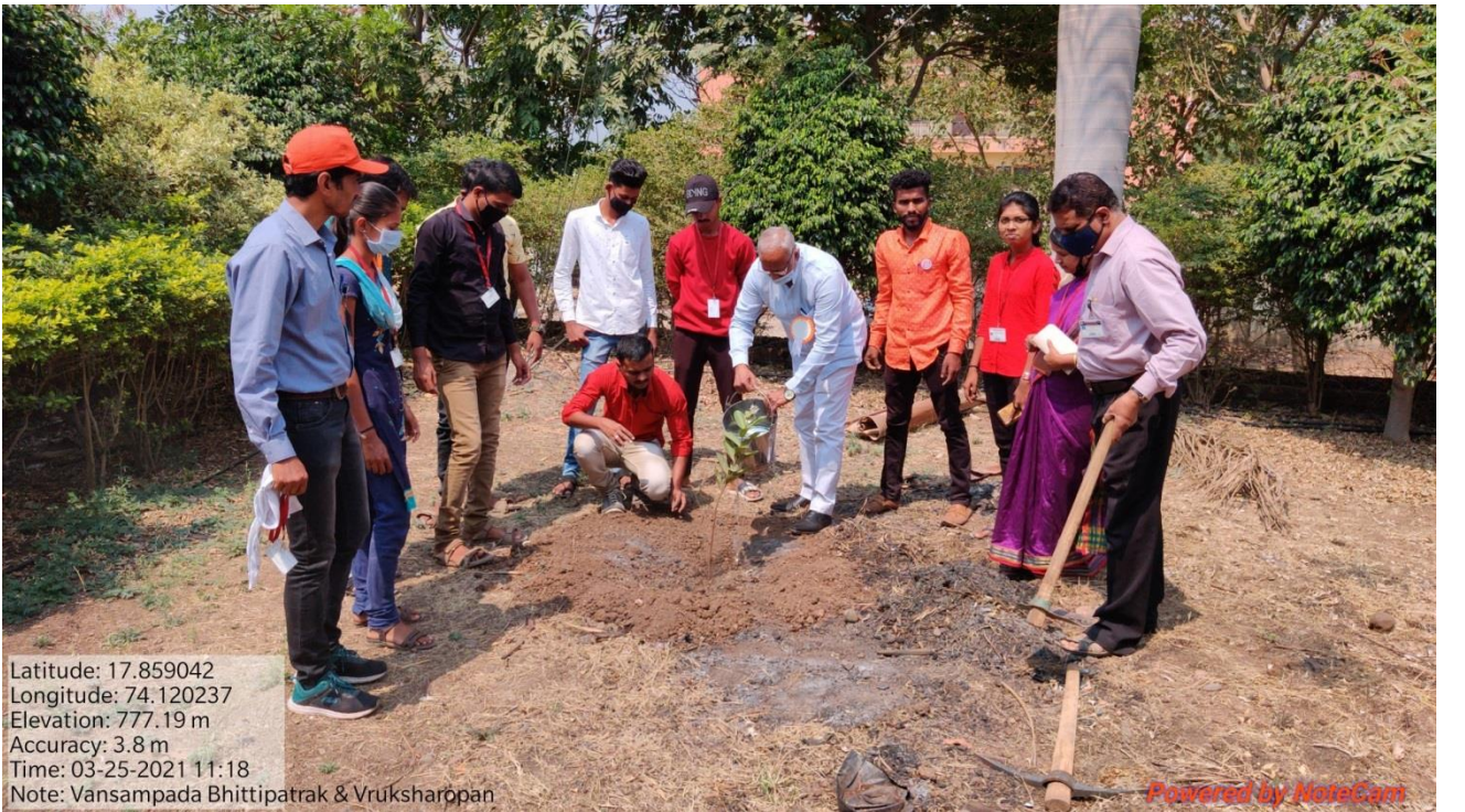
यंग इन्स्पिरेटीव नेटवर्क सातारा यांनी दिलेली वृक्षांचे रोपण करताना मा.प्राचार्य, प्रिन्सिपल व विद्यार्थी