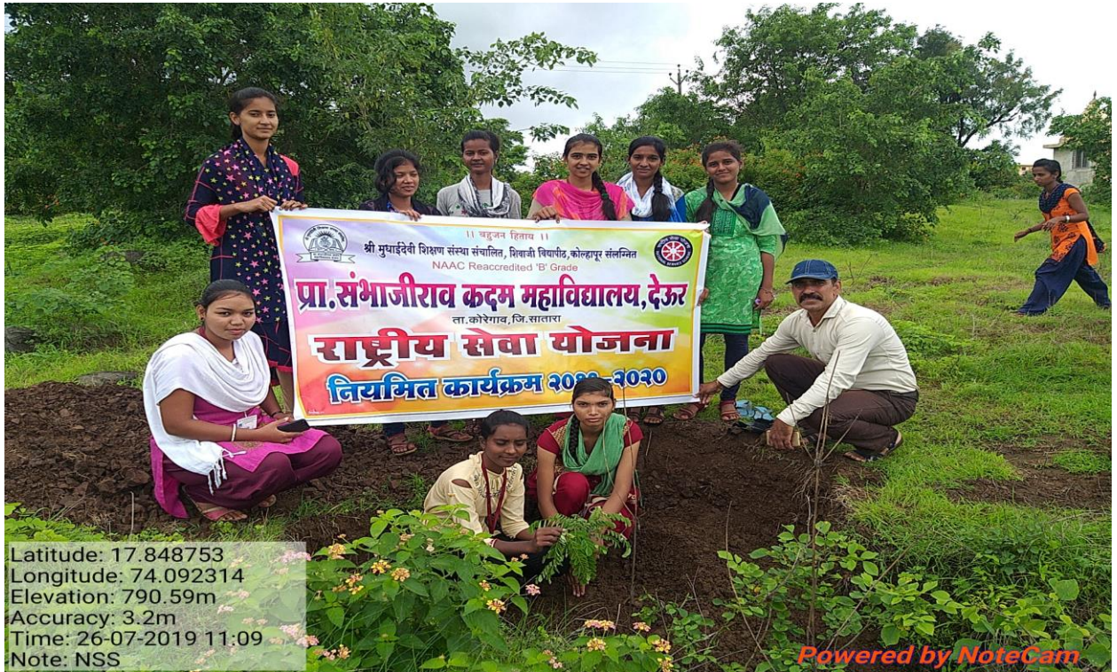
Observed a Tree Plantation Drive at Deur and Dahigaon Villages