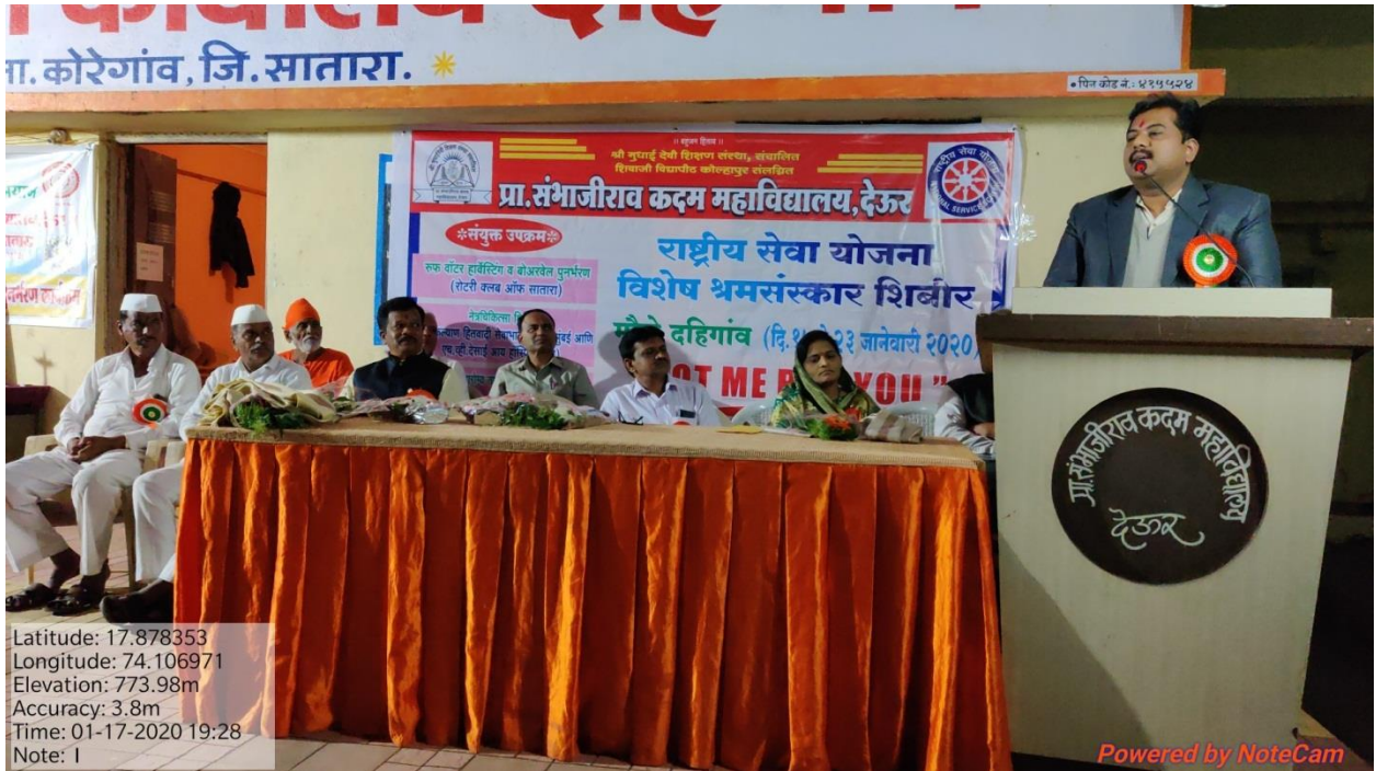
A Collaborative Programme with Rotary Club and NSS: The Social Movement of Youth (an MOU Activity).