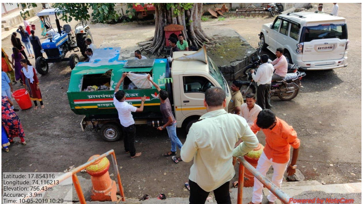
05.10.2019 Swachh Bharat Abhiyan: Plastic Free Movement at Deur