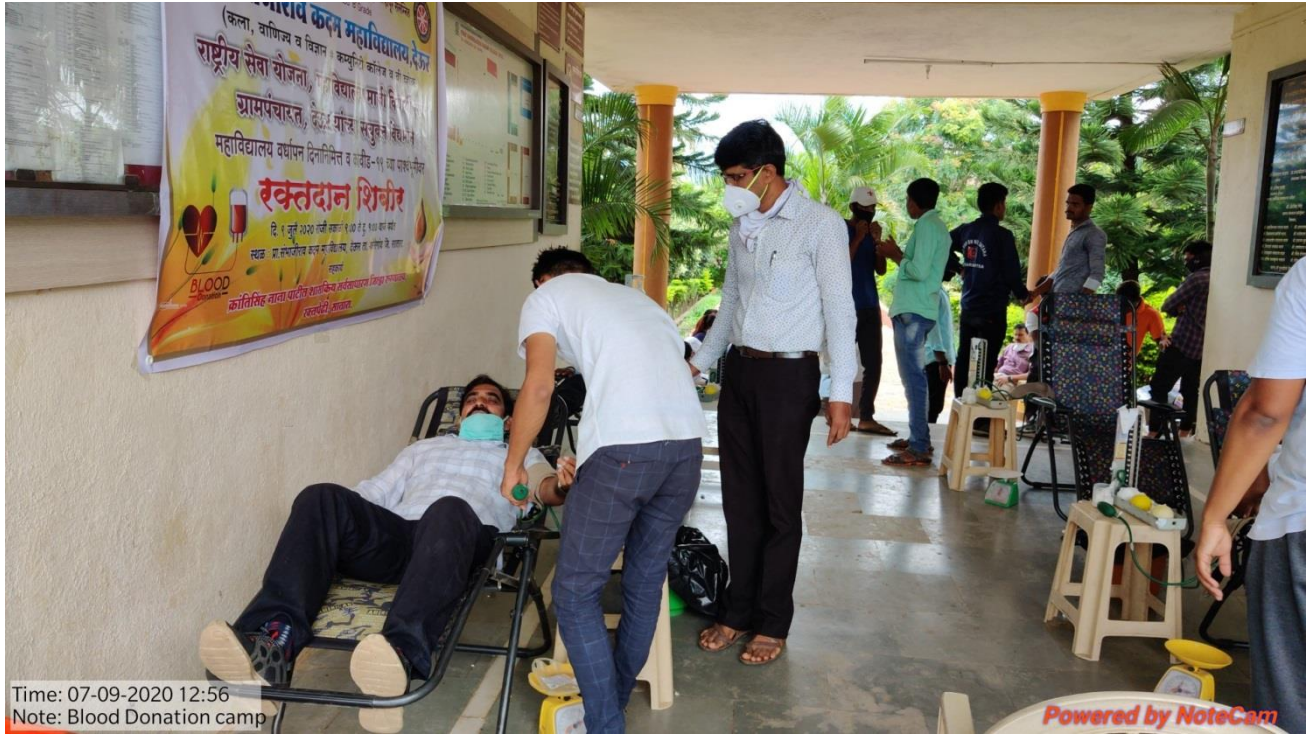
Organized a Blood Donation Camp under Corona-Pandemic Situation for Village, Deur09.07.2020