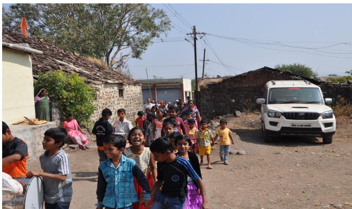
17.01.2020 Organized a Rally on National Integrity & Awareness in Dahigaon Village