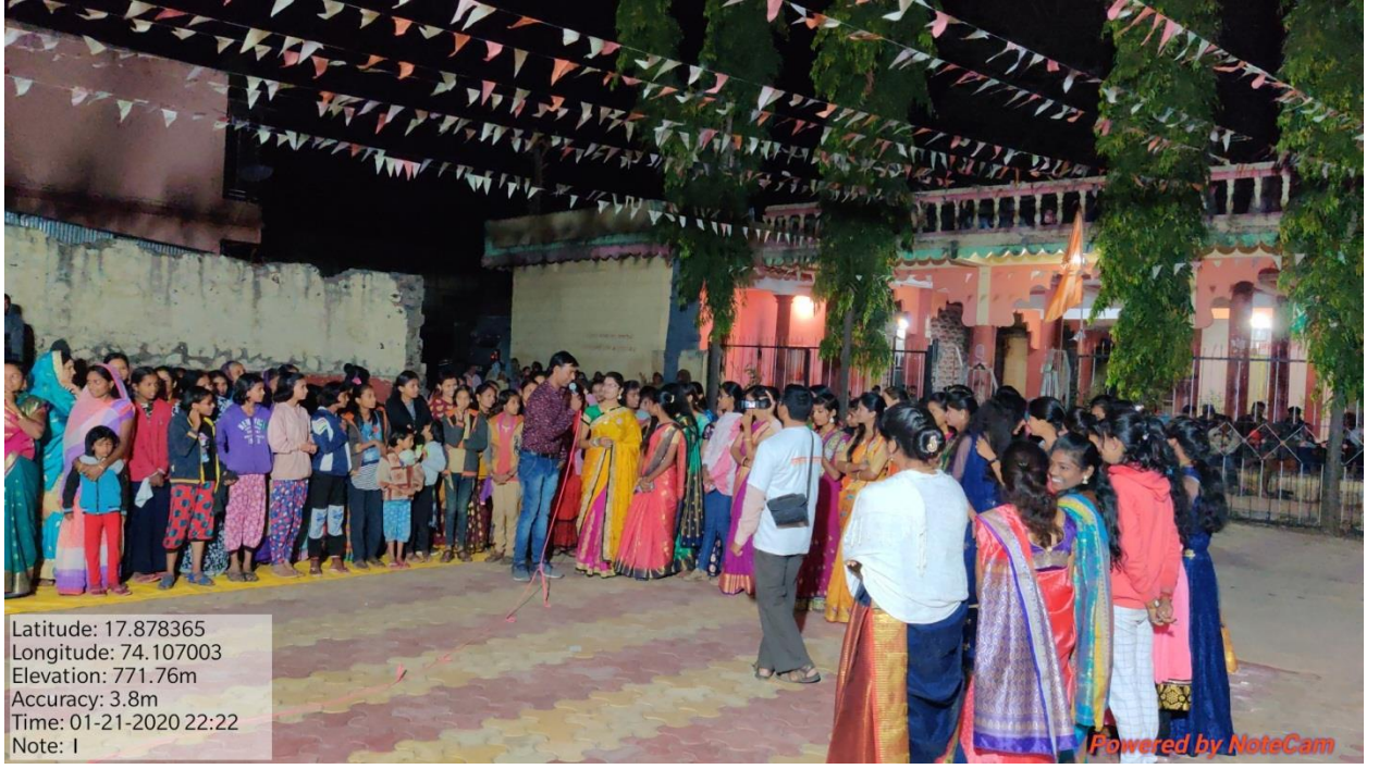
दि. २१.०१.२०२० रोजी सलाम सातारा फेम होम मिनिस्टर कार्यक्रमात सहभागी महिला