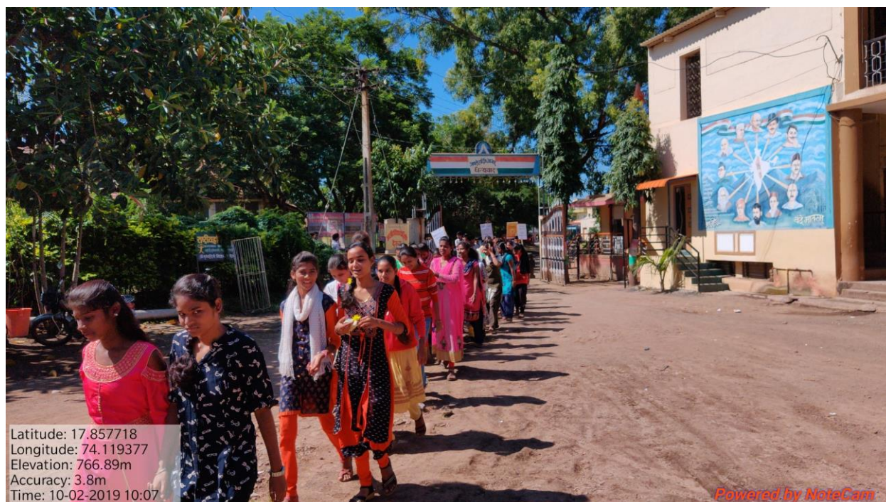
Mahatma Gandhi Jayanti Plastic Mukta bharaat , Cleanliness Drive & Tobacco-free Awareness Rally Date : 02.10.2019