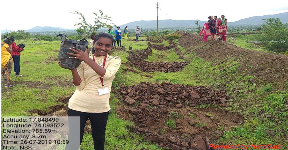
Observed a Tree Plantation Drive at Deur and Dahigaon Villages