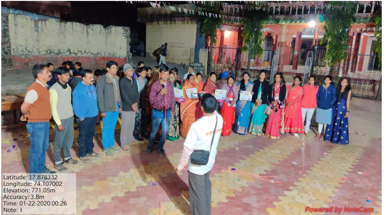
दि. २१.०१.२०२० रोजी सलाम सातारा फेम होम मिनिस्टर कार्यक्रमात सहभागी महिला