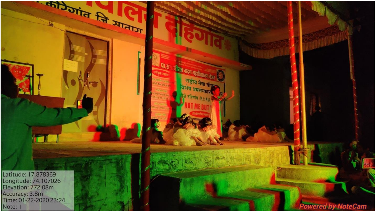
दि.२२.०१.२०२० रोजी सांस्कृतिक कार्यक्रम सादर करताना जि. प. शाळा व अंगणवाडी, दहिगाव.