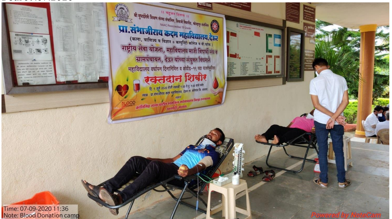
Organized a Blood Donation Camp under Corona-Pandemic Situation for Village, Deur09.07.2020