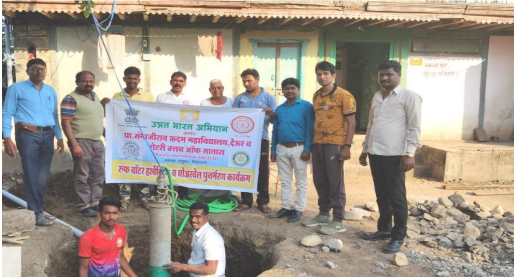
Roof Water Harvesting and Bore-well Recharge Project at Dahigaon Village (Date: 18.01.2020)