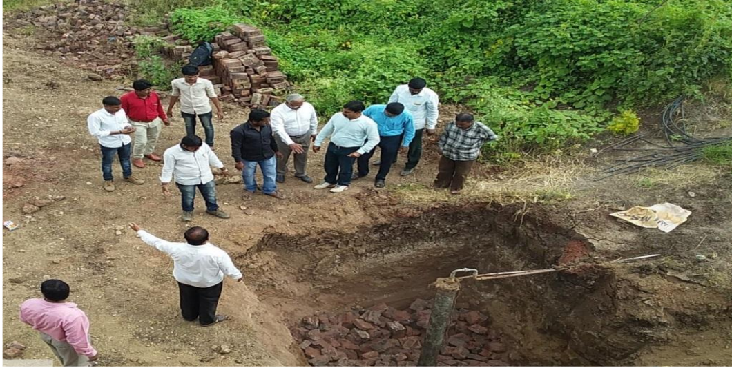
Roof Water Harvesting and Bore-well Recharge Project at Prof. Sambhajirao Kadam College, Deur (Date: 18.01.2020)