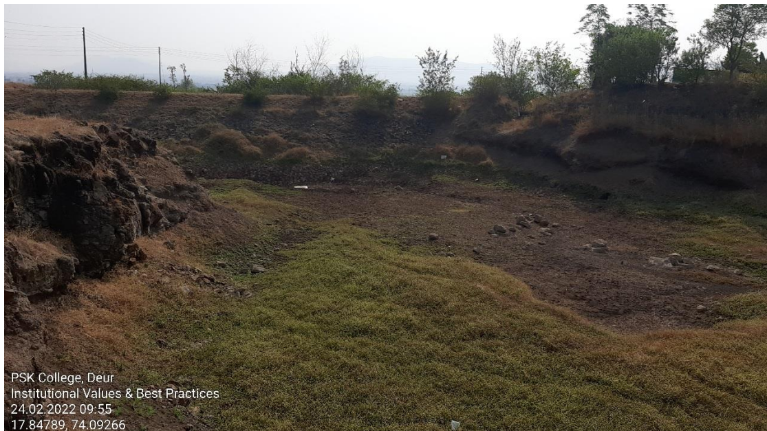
Construction of Tanks and Bunds, Place: Khandobacha Mal, Deur (Tal. Koregaon, Dist. Satara)