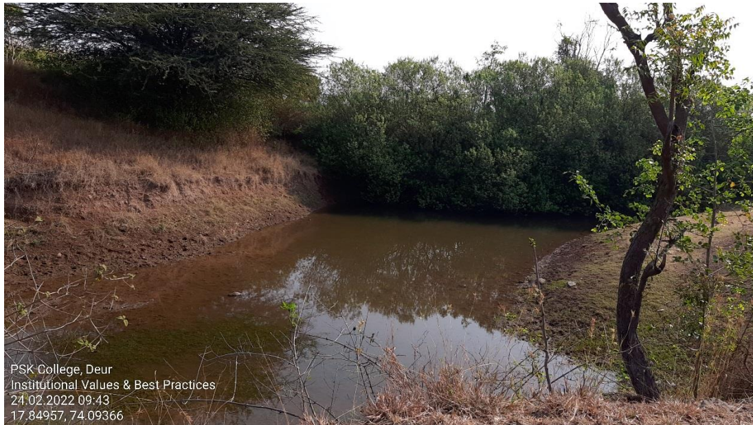
Construction of Tanks and Bunds, Place: Khandobacha Mal, Deur (Tal. Koregaon, Dist. Satara)