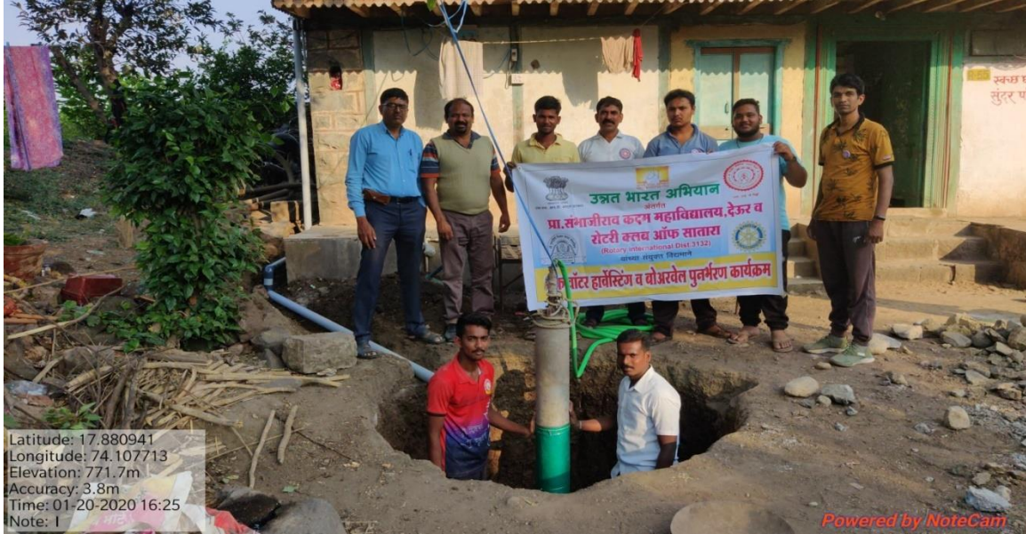
Rain water harvesting and Bore well Recharge, Place: Dahigaon (Tal. Koregaon, Dist. Satara)