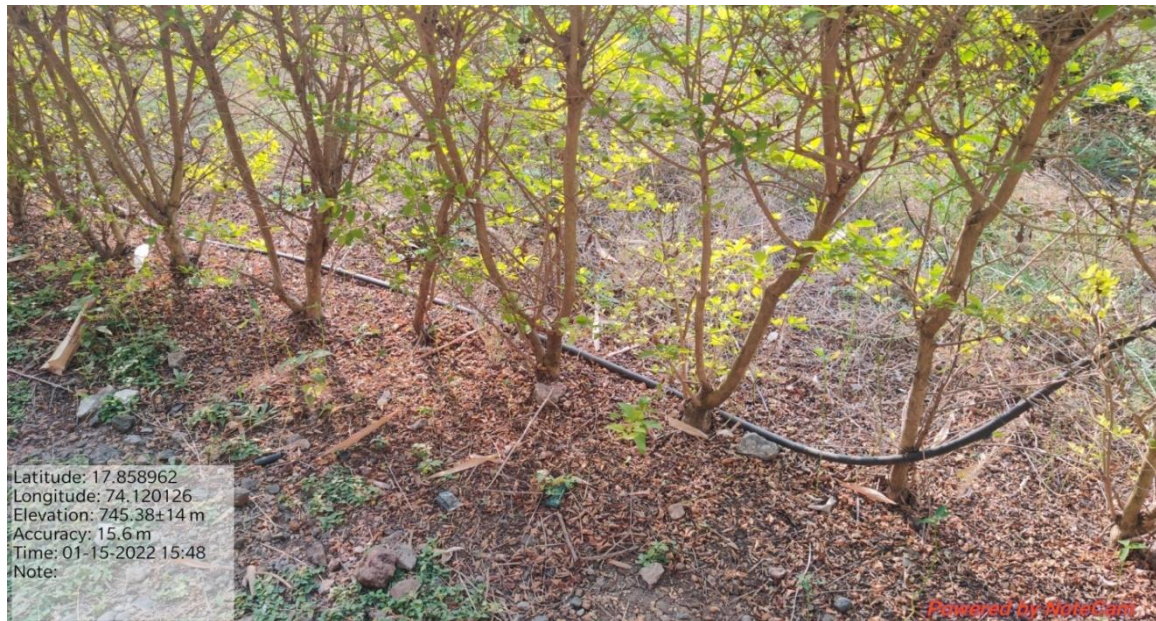
Waste Water Recycling: Waste Water used for Campus Plantation