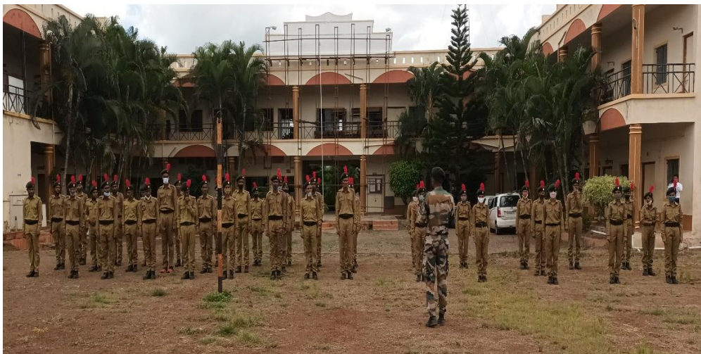
NCC Cadet's Ready to Parade