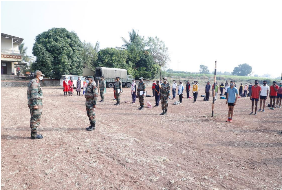
NCC Enrollment Process