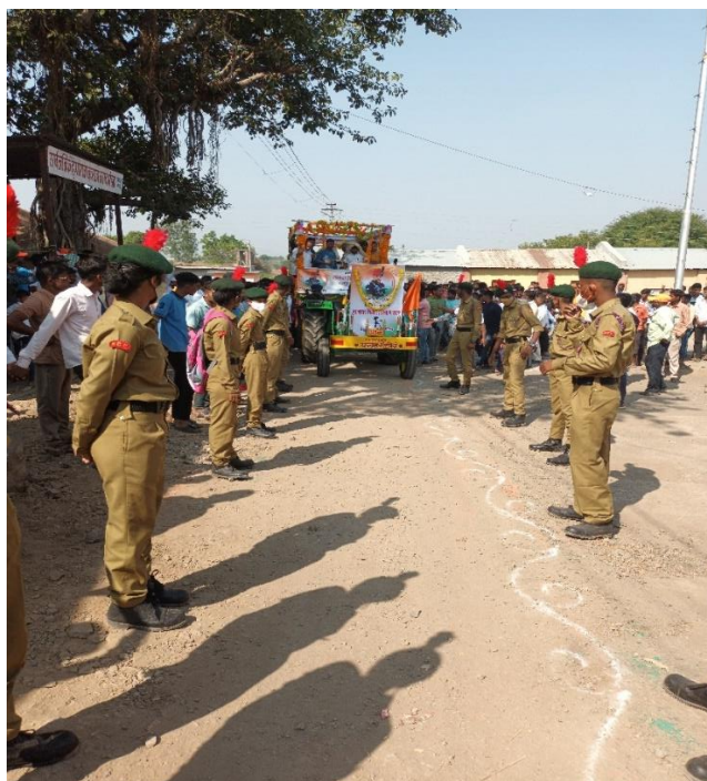
Participation Martyr rally at Wathar Station