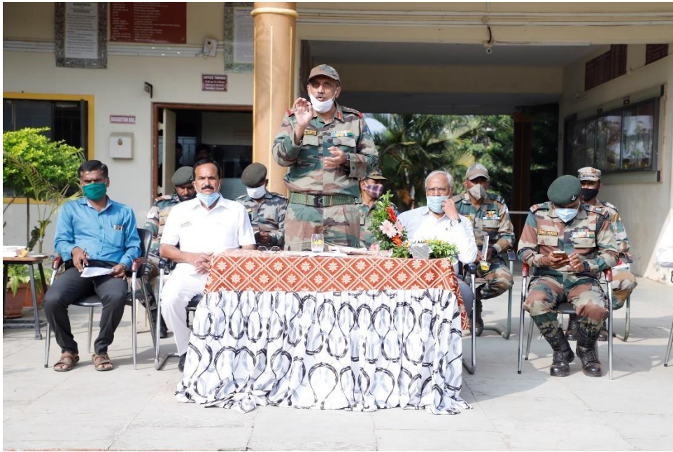
Inauguration Function of NCC in the presence of Commanding Officer Col. Parag Gupte