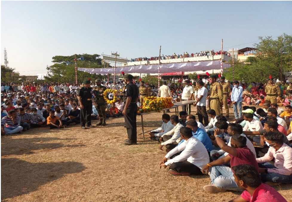
NCC Cadet's participation in Martyr Funeral Programme at Wathar Station