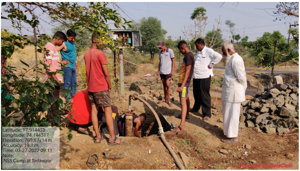
Rain water harvesting and Bore well Recharge, Place: Tadawale S.W., (Tal. Koregaon, Dist. Satara)