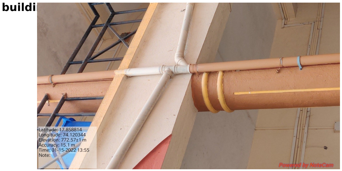
Rain Water harvesting at College Campus