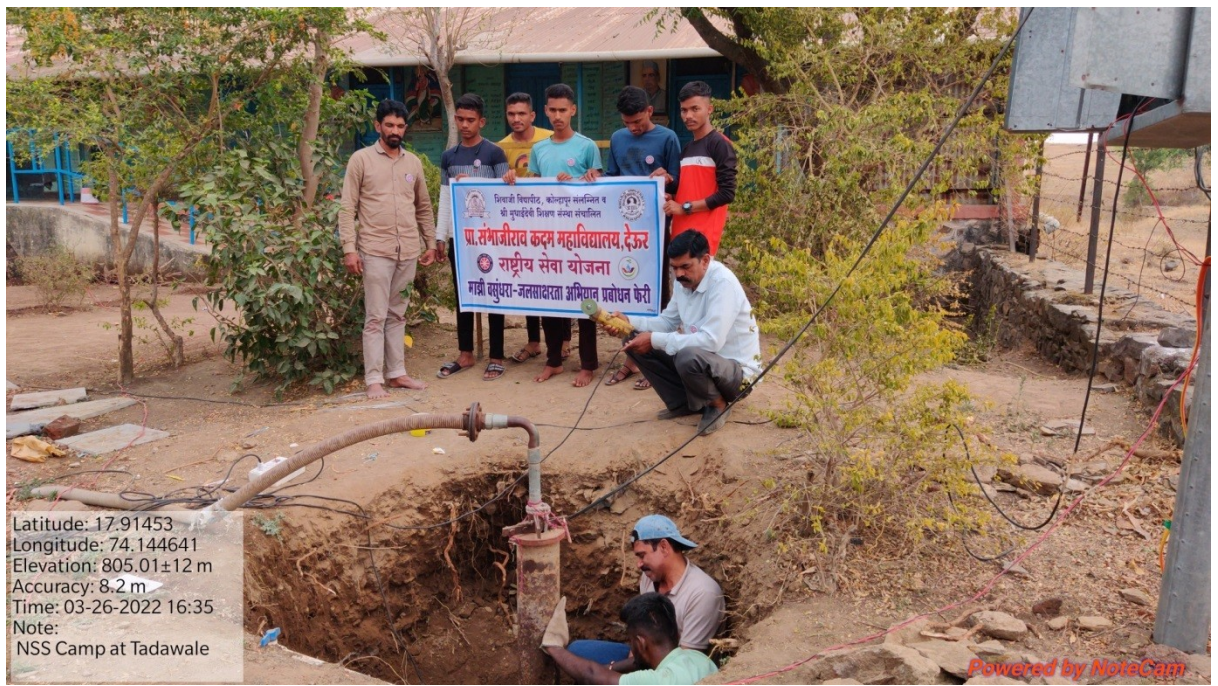
Rain water harvesting and Bore well Recharge, Place: Tadawale S.W., (Tal. Koregaon, Dist. Satara