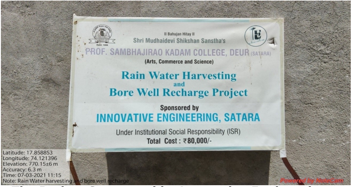
The Project Sponsored by Innovative Engineering, Satara