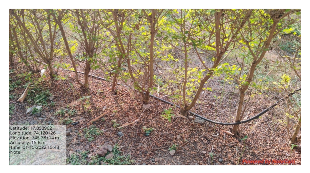
Waste Water Recycling: Waste Water used for Campus Plantation