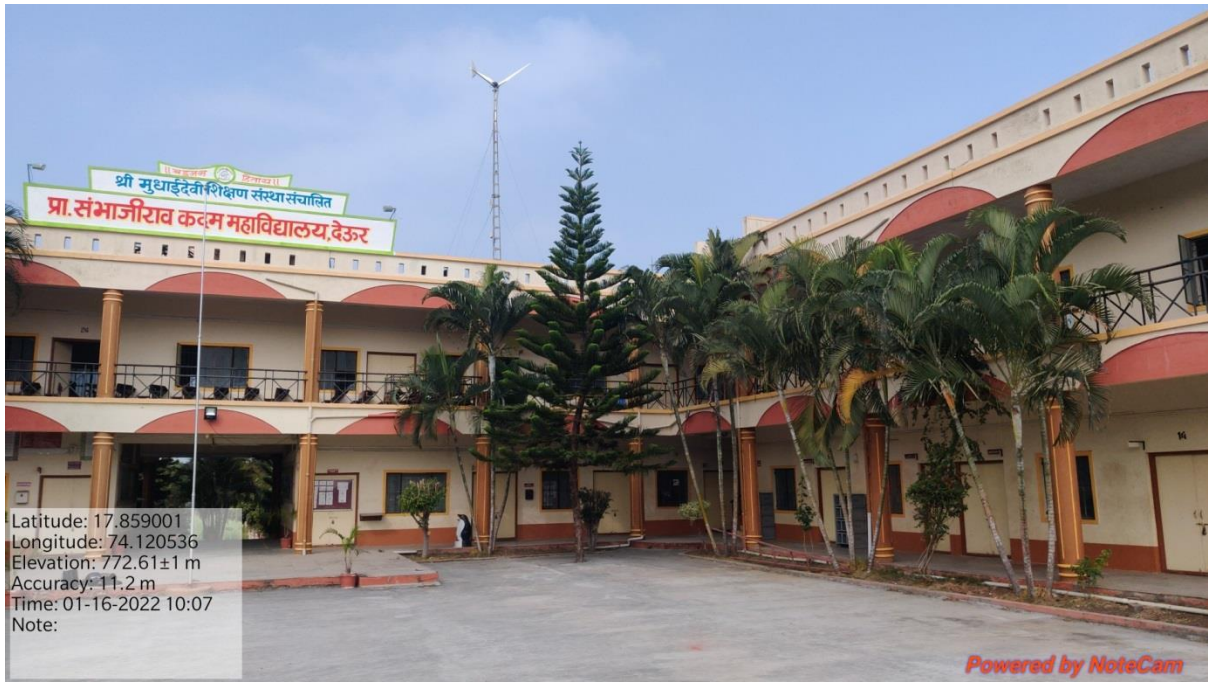
Landscaping with trees and plants