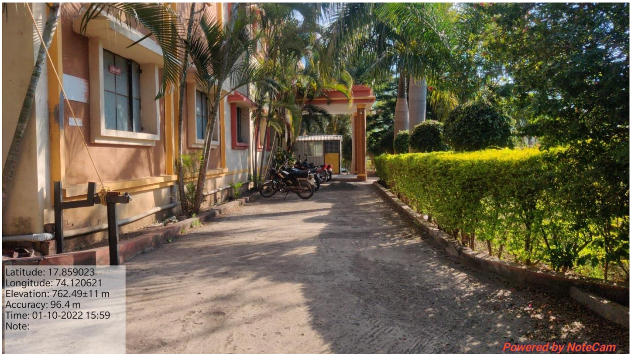
Pedestrian Friendly pathways