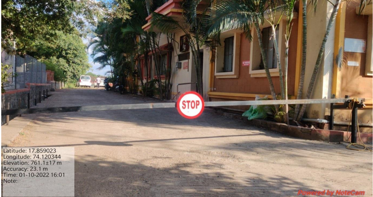
Restricted entry of automobiles: