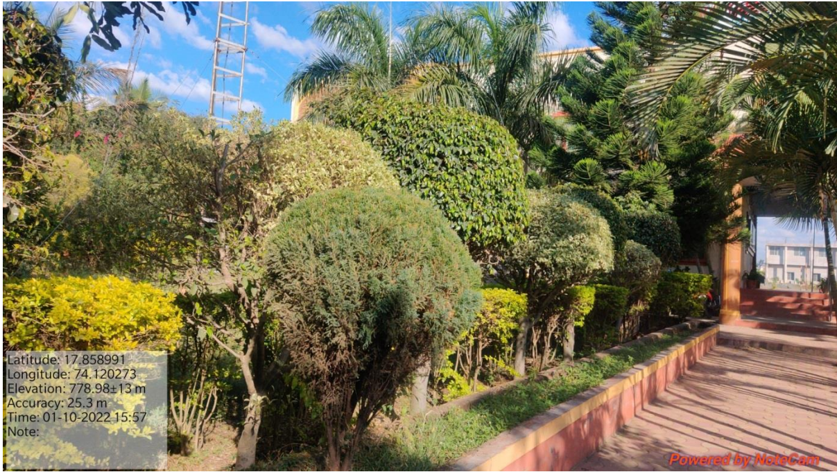
Landscaping with trees and plants