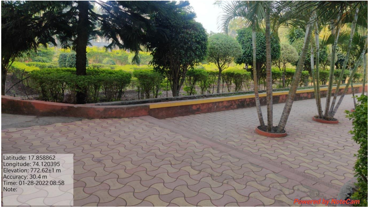
Clean, neat and plastic free campus