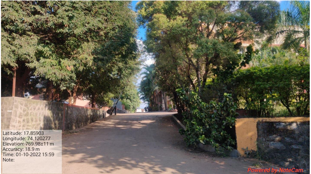
Pedestrian Friendly pathways