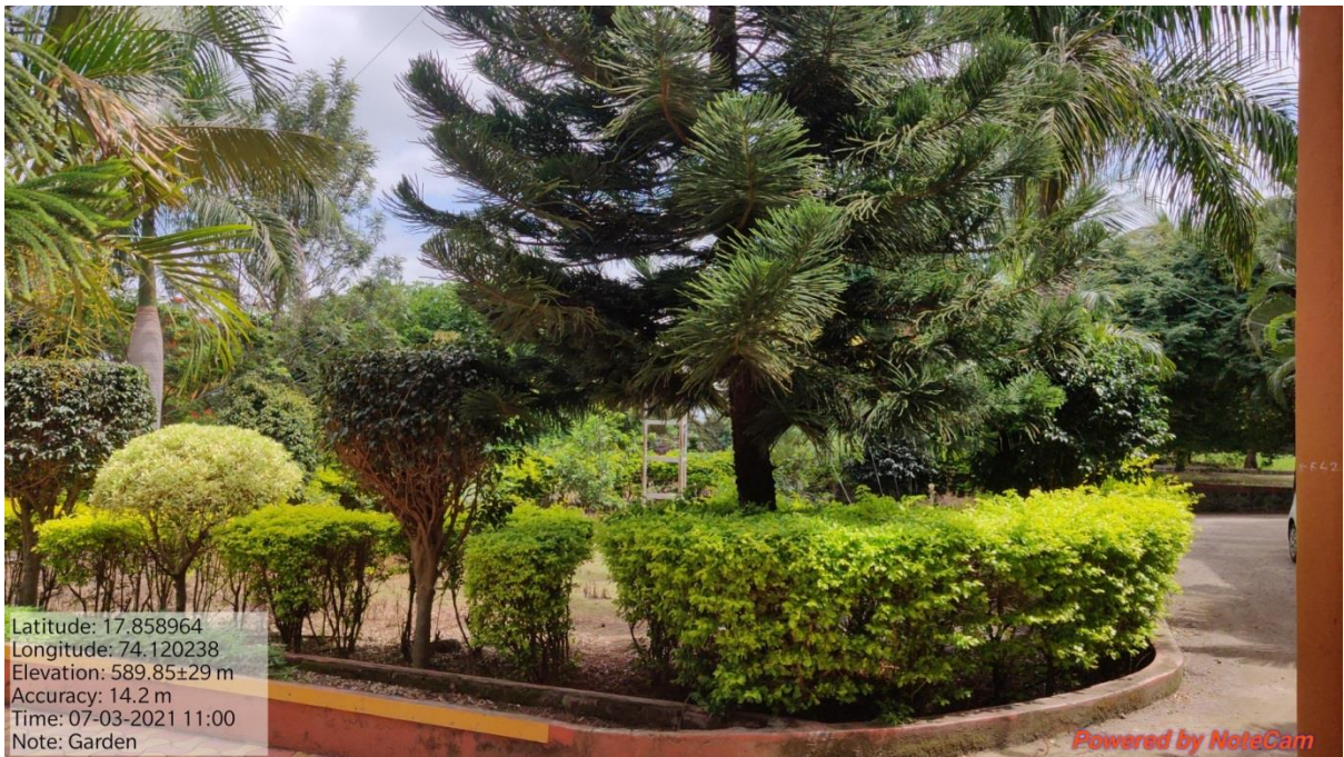
Landscaping with trees and plants