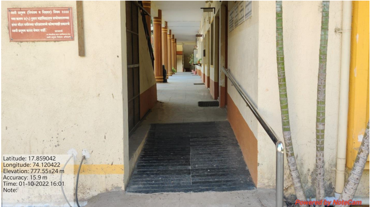
Pedestrian Friendly pathways