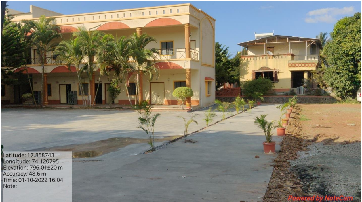
Pedestrian Friendly pathways