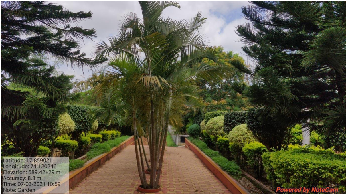
Landscaping with trees and plants