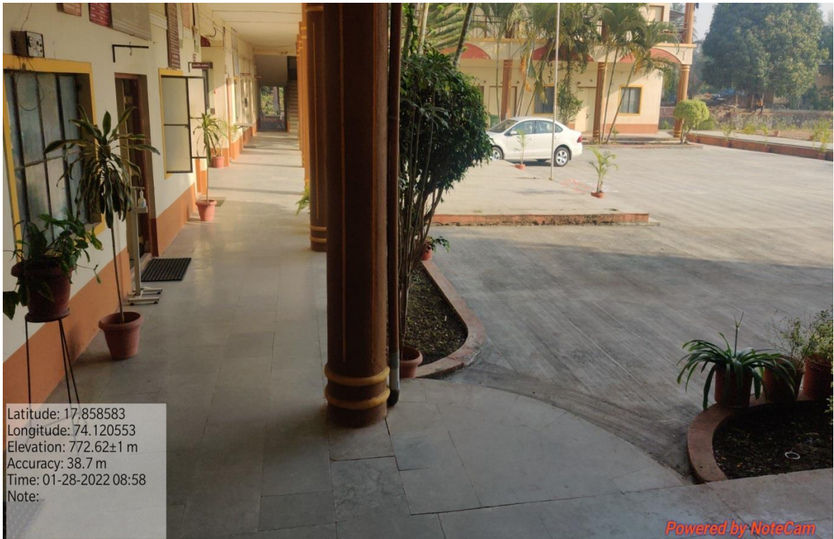
Clean, neat and plastic free campus