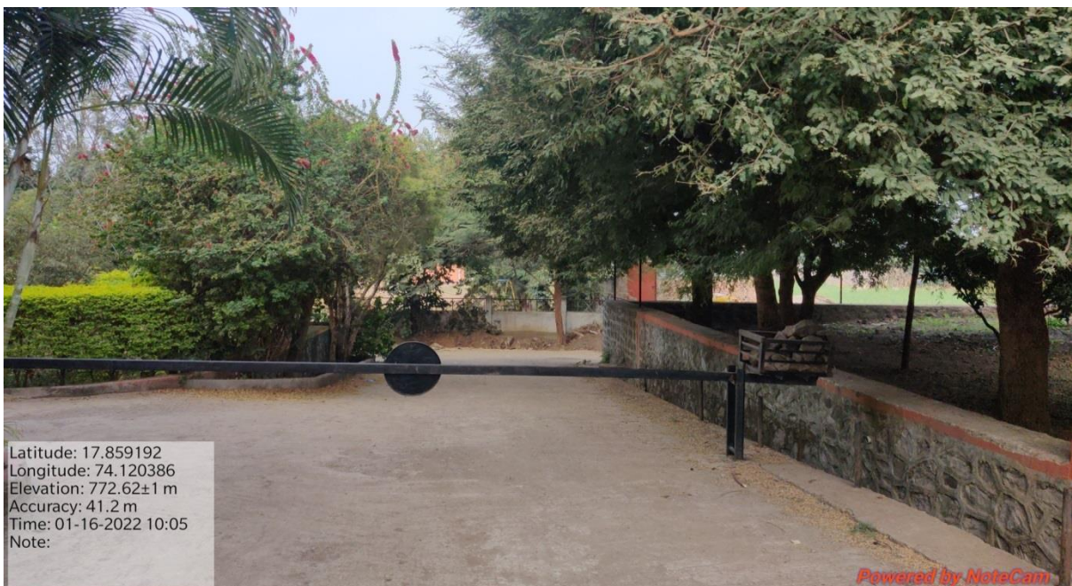
Restricted entry of automobiles: