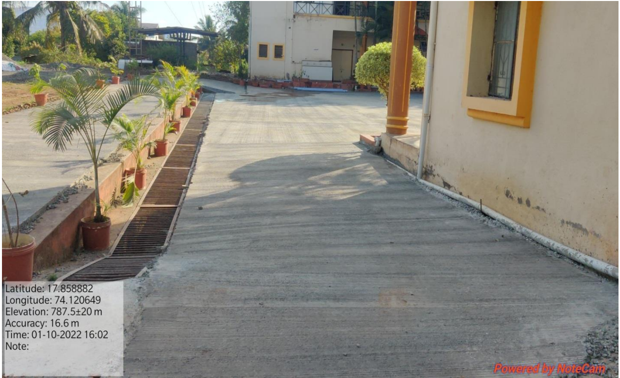
Pedestrian Friendly pathways