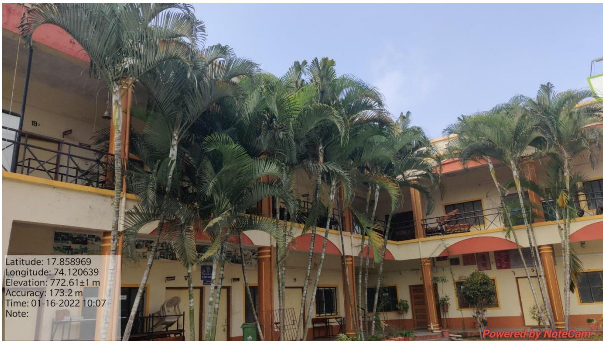
Landscaping with trees and plants