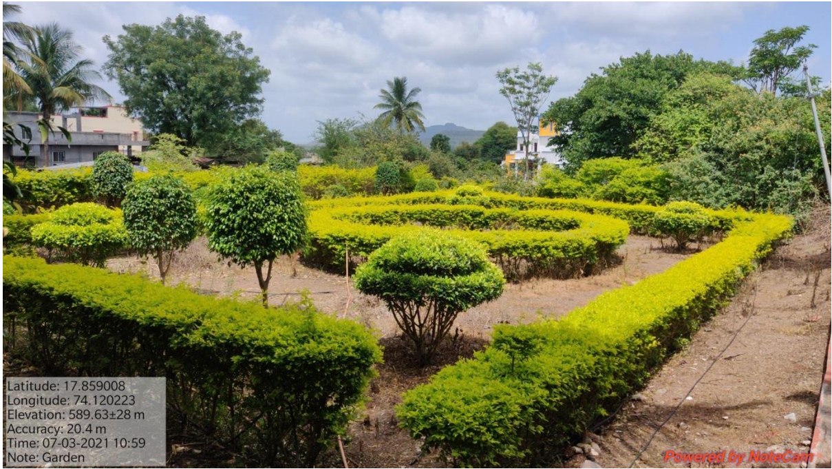
Landscaping with trees and plants