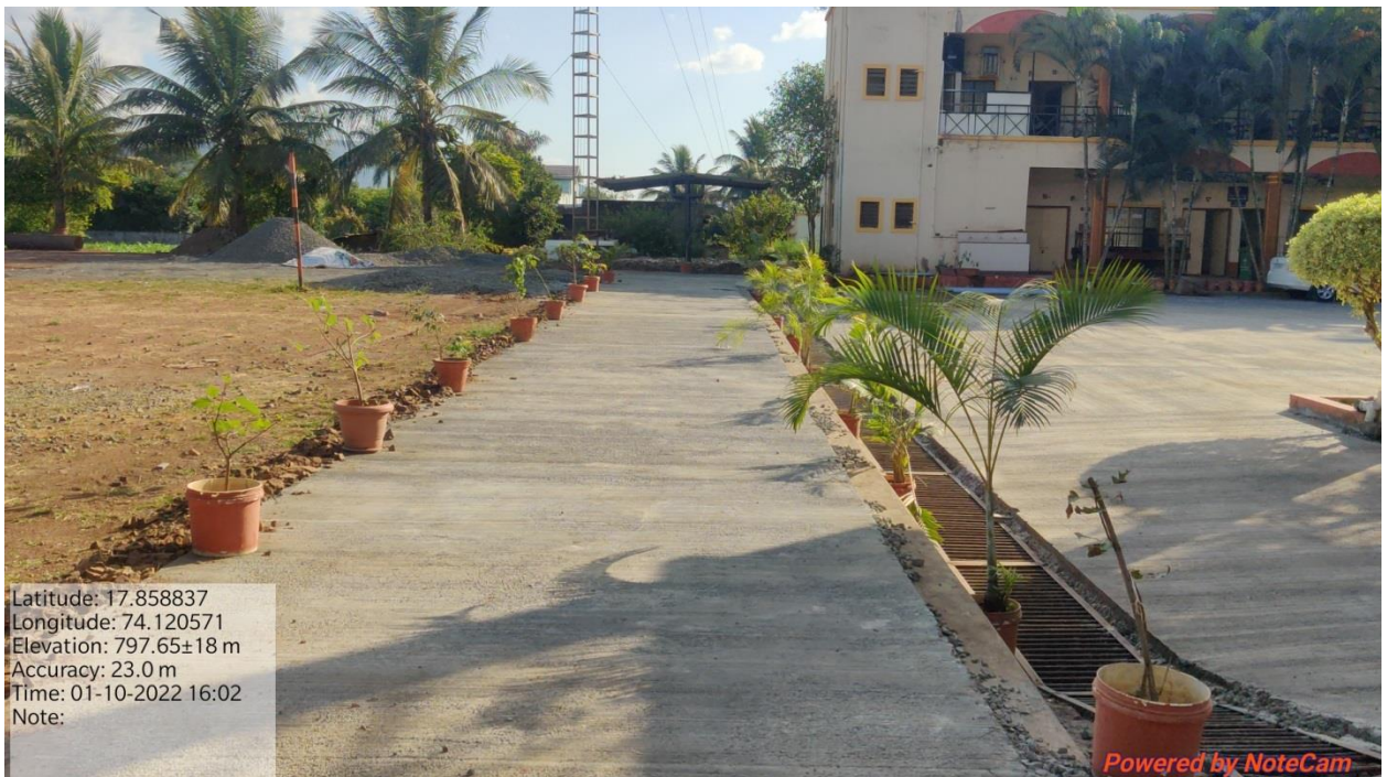
Pedestrian Friendly pathways