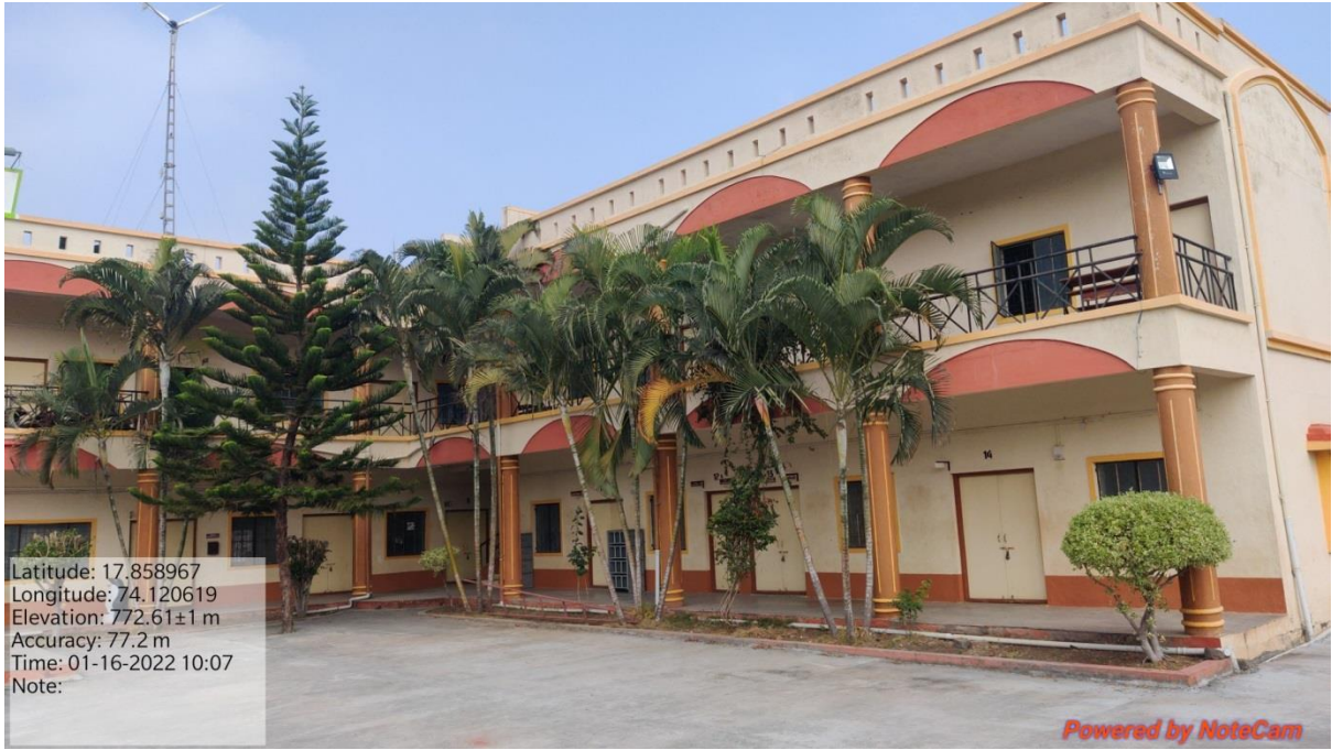
Landscaping with trees and plants