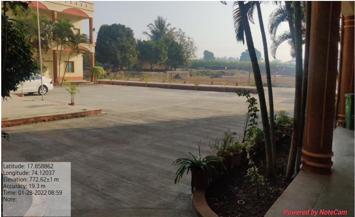
Clean, neat and plastic free campus