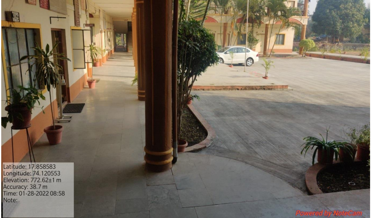
Clean, neat and plastic free campus