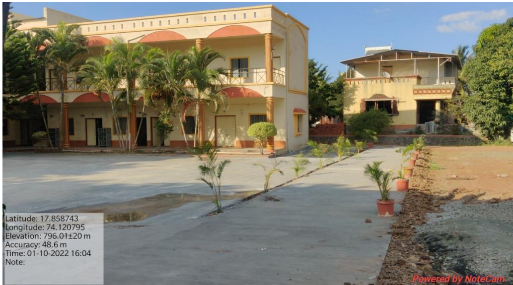
Fig. 8 Tactile path are available in the campus