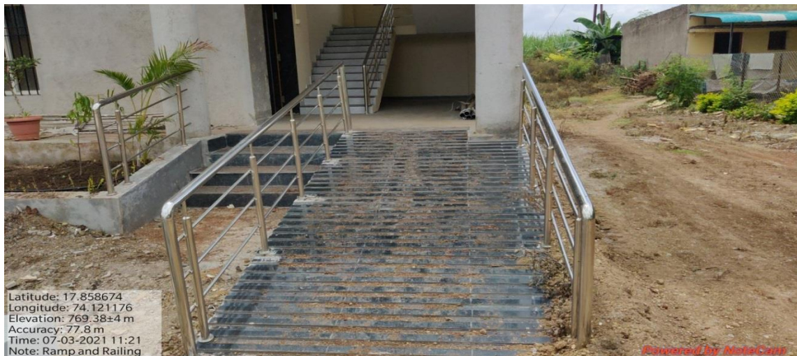
Fig. 2 Ramps & Railing at the entry of the College