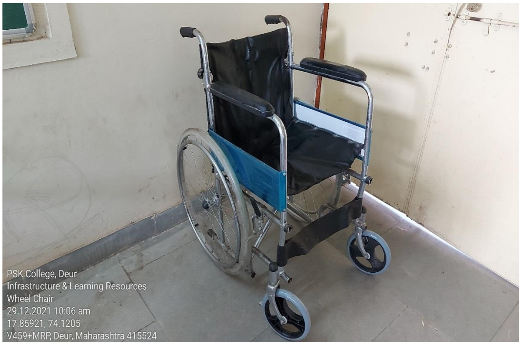
Fig. 11 Wheelchair for Divyangjan donated by alumni. Date: 12.01.2019