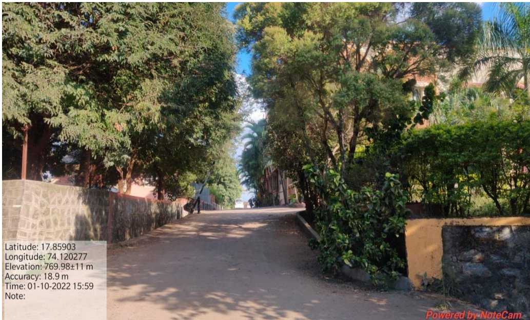
Fig. 9 Tactile path are available in the campus