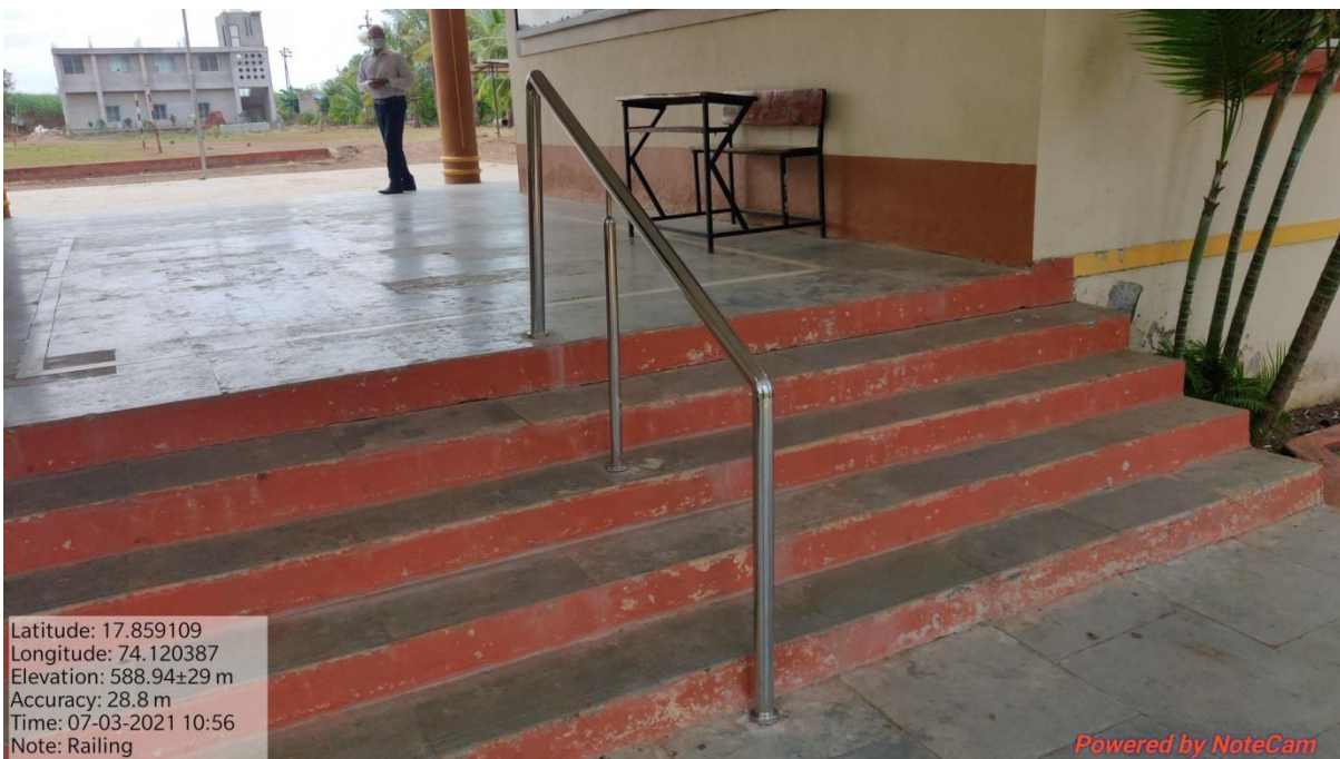
Fig. 4 Ramps at the entry of the College