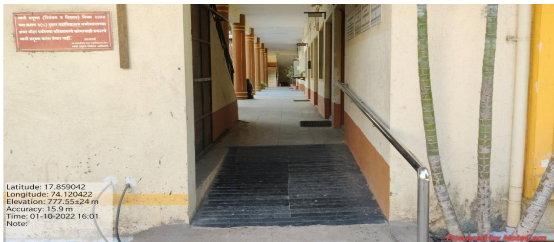
Fig. 1 Ramps & Railing at the entry of the College

The Ramps are built through the campus where uneven floor levels or kerbs are present to provide convenience and prevent tripping accidents. Ramps are helpful to push a pallet truck, trolley, or wheel chair over a kerb or step by negotiating just a few inches of height difference. Utility ramps solve the problem and make wheeled movement between uneven levels very easy. The following ramps were built in college campuses for continence and safety of disabled persons (Divyangjan) shown in figure 1to4.