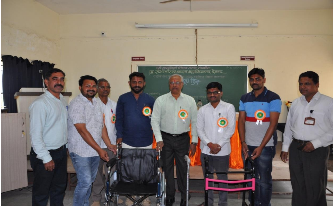
Fig. 10 Wheel chair, Walker and Stick donated by alumni. Date: 12.01.2019