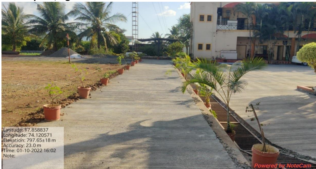
Fig. 6 Tactile path are available in the campus