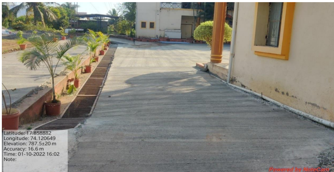
Fig. 7 Tactile path are available in the campus