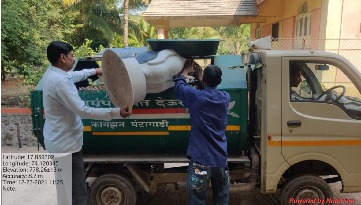
Local village Grampanchayat Vehicle