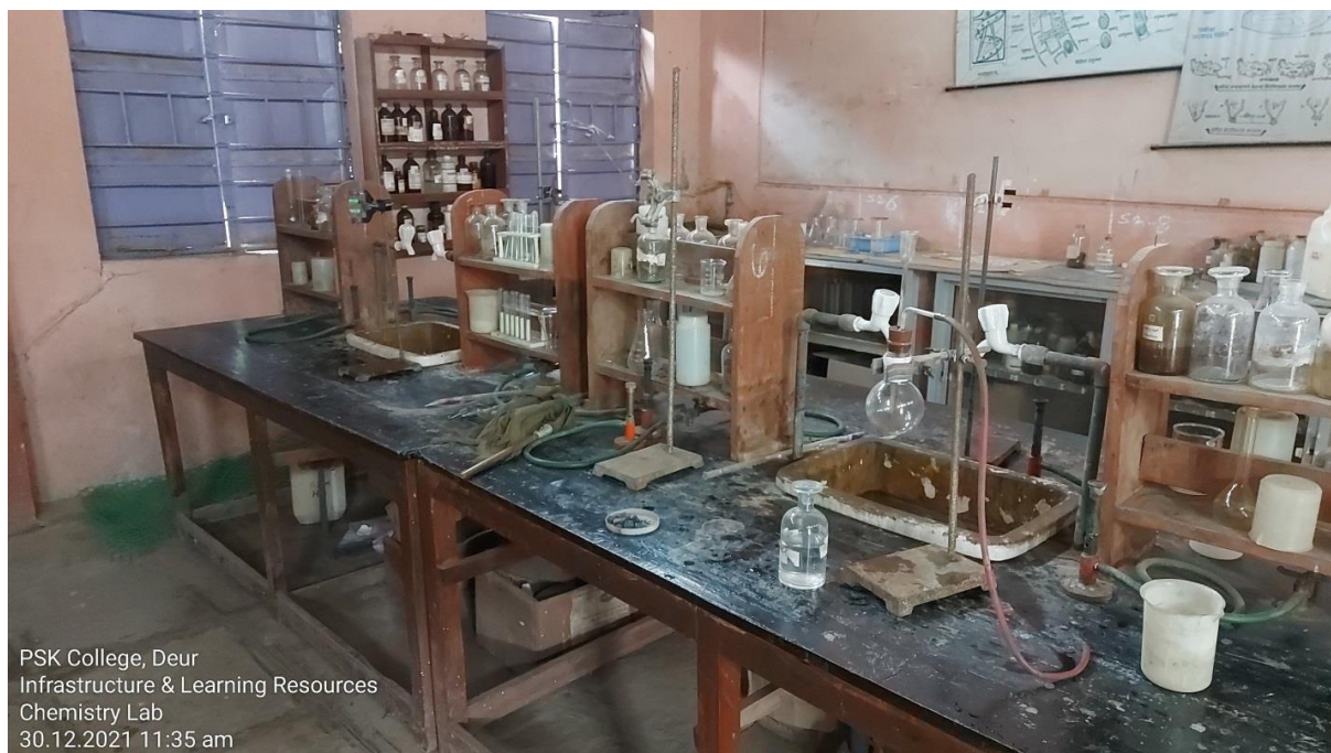
Science laboratories (Chemistry Lab)