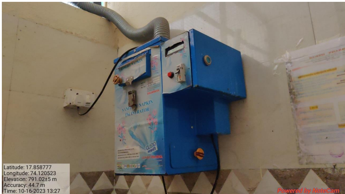
Sanitary Napkin Disposal Machine