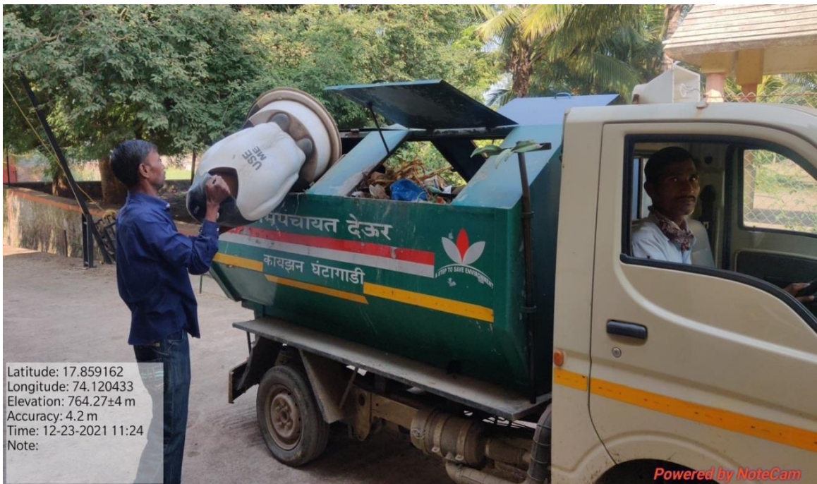
Local village Grampanchayat Vehicle