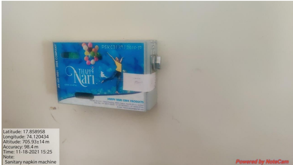
Sanitary Napkin Vending Machine