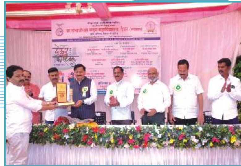
Felicitation by Sanstha