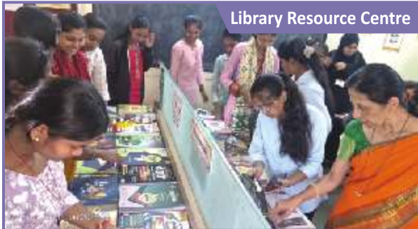
Library Resource Centre