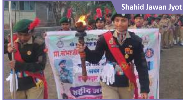
Shahid Jawan Jyot